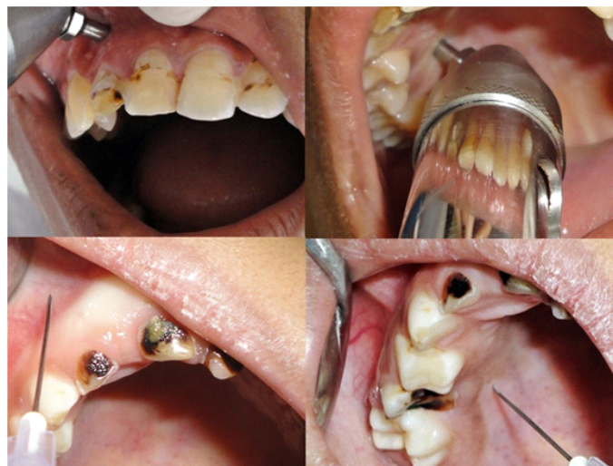
Figure 2: A-Buccal infiltration by needle-less jet injector B-Palatal infiltration by needle-less jet injector C-Buccal infiltration by conventional technique D- Palatal infiltration by conventional technique